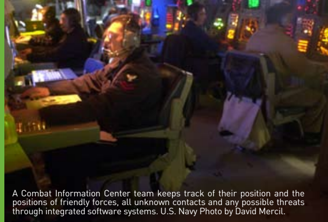
A Combat Information Center team keeps track of their position and the positions of friendly forces, all unknown contacts and any possible threats through integrated software systems.

Many forms of financial aid are available. For more information, contact the Office of Financial Aid at (678) 915-7290.