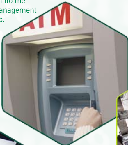
Center: ATM and online banking systems function only as well as the software engineered to power them.

At Southern Polytechnic, our Software Engineering students learn strategies and procedures that will give them a competitive edge in the market. The Graduate Certificate in Software Engineering is intended to provide an entry into the engineering and management of software projects. All the courses taken toward the certificate also count toward the Master of Science degree in Software Engineering.